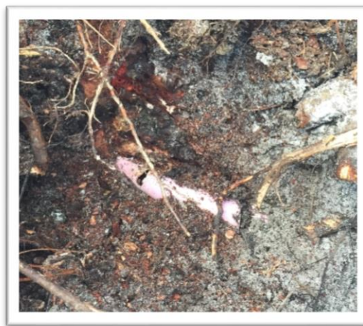
Broken Irrigation Pipe